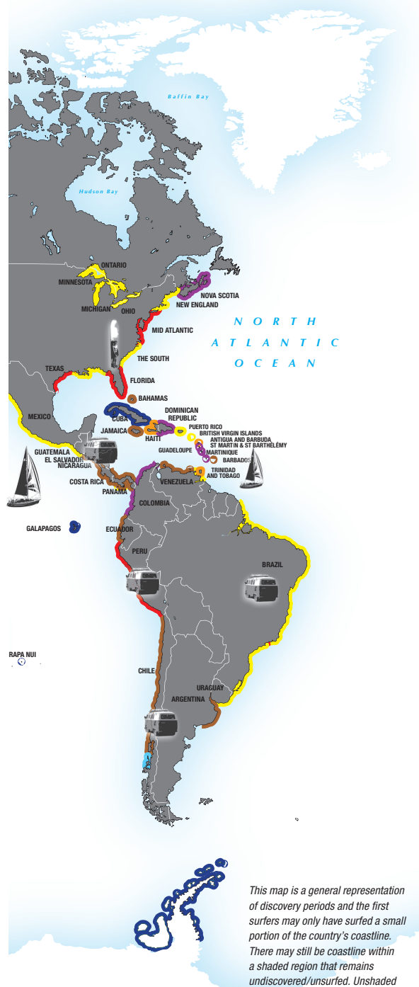
This map is a general representation of discovery periods and the first surfers may only have surfed a small portion of the country's coastline. There may still be coastline within a shaded region that remains undiscovered/unsurfed. Unshaded coastline is not covered in The World Stormrider Surf Guide, but may have some existing surf culture/history.

by a young local surfer and phenomenal swimmer, Duke Kahanamoku, who was honing his stroke to become the 1912 Olympic Champion in the 100m freestyle. Afterwards, he embarked on a worldwide swimming tour, which he unofficially used to introduce surfing to a waiting world. Surfing's foremost ambassador hit the waves in California and New Jersey (1912), Sydney (1914) and NZ (1915), sowing the seeds of today's global surf culture. Along with Duke, lifeguards like George Freeth patrolled the frontline, promoting many forms of surfing on various surfcraft and rescue equipment. They were exclusively Australian or American through the mid 20th century, and were joined by US servicemen, stationed to the outposts of the world. Meanwhile, a select cadre of global travellers with serious wanderlust struck out to the corners of the unknown surf world, pioneering some of the best waves on the planet, and converting the natives who took an interest.